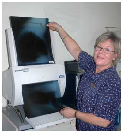
Film scanner at each branch

This change significantly improves the Radiology Service we provide to all referring practitioners and their patients.