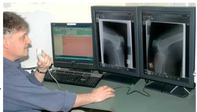
Images sent electronically to Radiologists reporting PACS Workstations